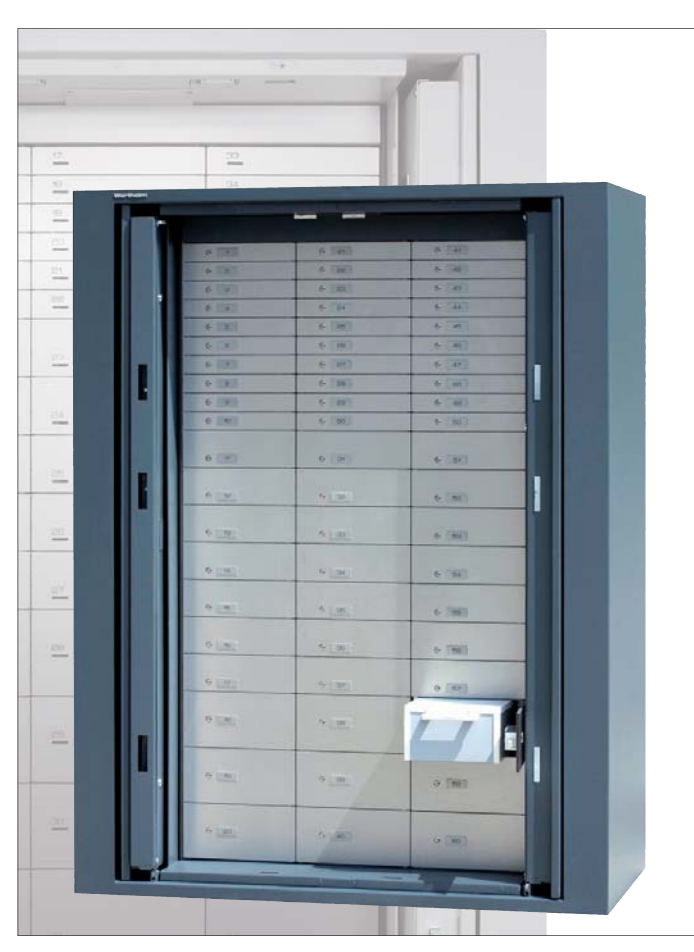
Fig. Swing-in door safe BWP1902, double-doored, special colour RAL 7016 anthracite grey E-Lock La Gard Combogard PRO, 60 deposit boxes with electronic cylindric lock